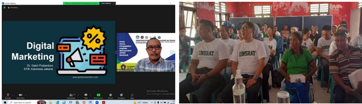
Figure 1. Pemaparan Materi via zoom

some participants still needed help in registering their businesses on Google My Business, mostly due to time constraints during the material delivery.