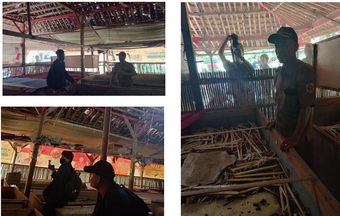
Figure 3. Community Service Activities

The second stage involved sharing information about pests that hinder cricket cultivation. The problem faced was the large number of pests that attack the crickets being raised, such as ants and geckos. These ants and geckos can enter the cricket box through the edges. Therefore, farmers can address this by attaching duct tape upside down to trap the ants and geckos inside.