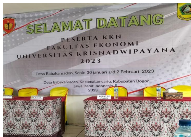
Figure 1. Babakanraden Village