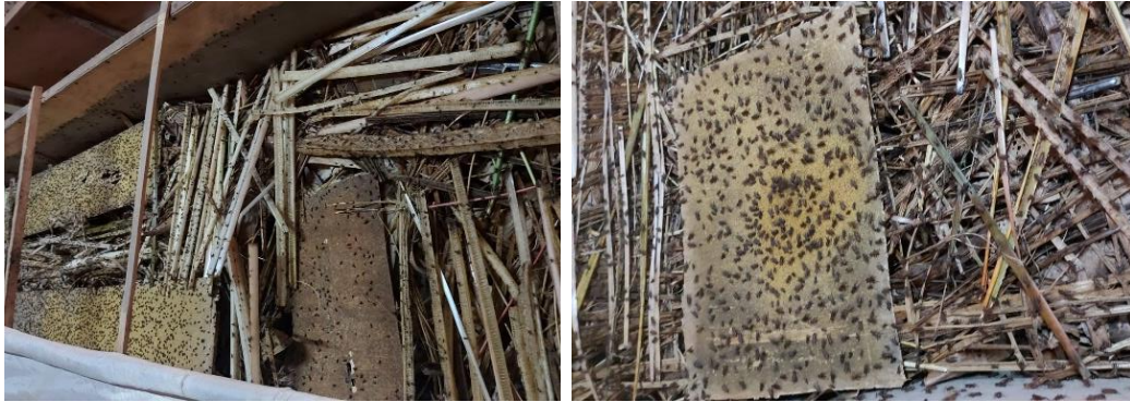
Figure 2. Cricket cage